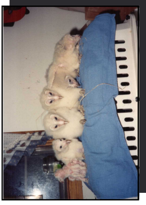
Barn Owl Nestlings

tions. BAWR has also created a Children's Wildlife Activity Book which we distribute to teachers, industry representatives, and various other organizations. This book is made possible through generous, local corporate and individual donations.